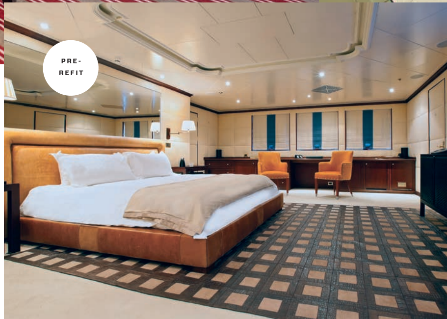
Above: the owner's suite includes a full-beam cabin and en suite. The post-refit color scheme is nautical with red accents. All of the carpets were designed by Michele Bönan Interiors