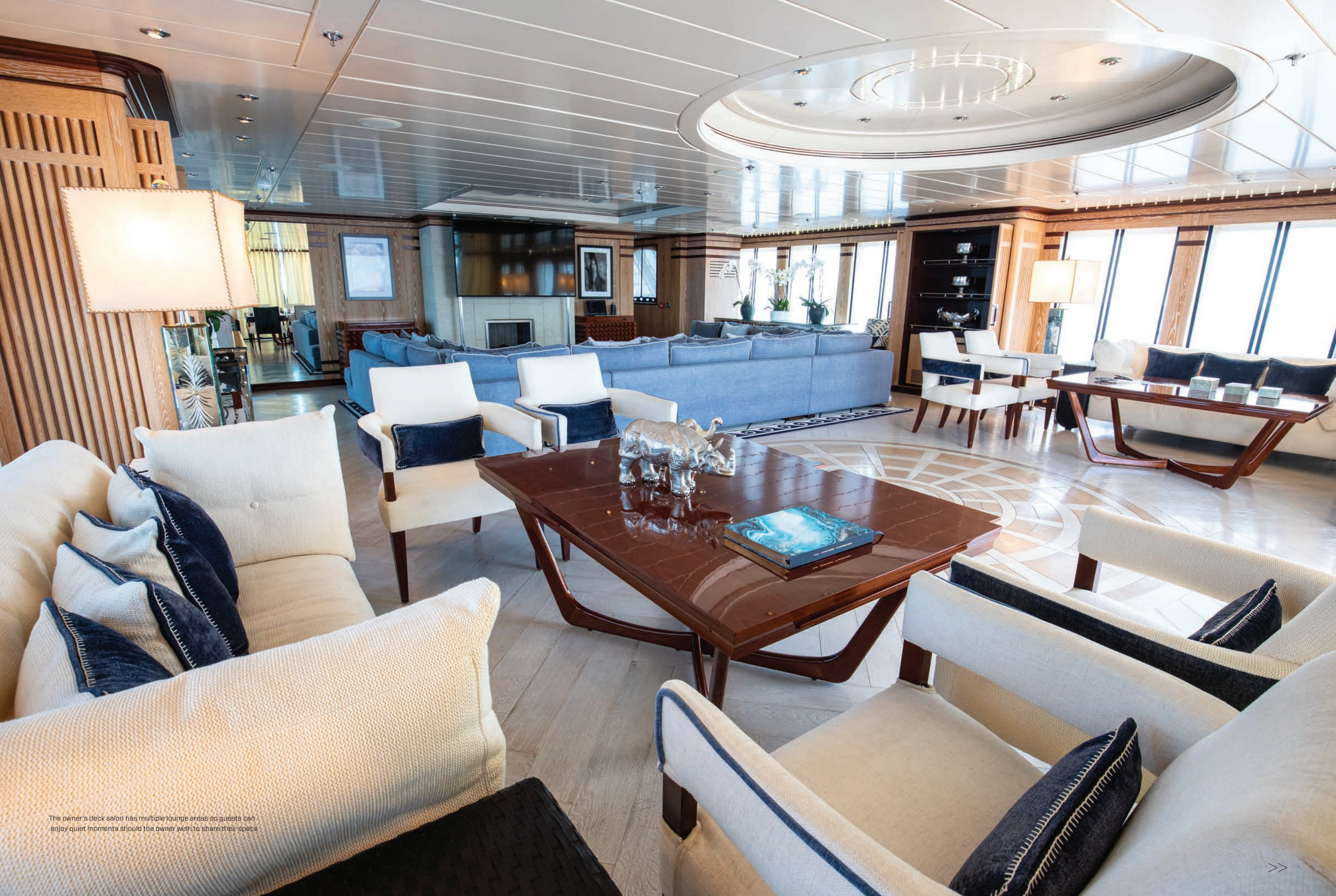
The owner's deck salon has multiple lounge areas so guests can enjoy quiet moments should the owner wish to share their space