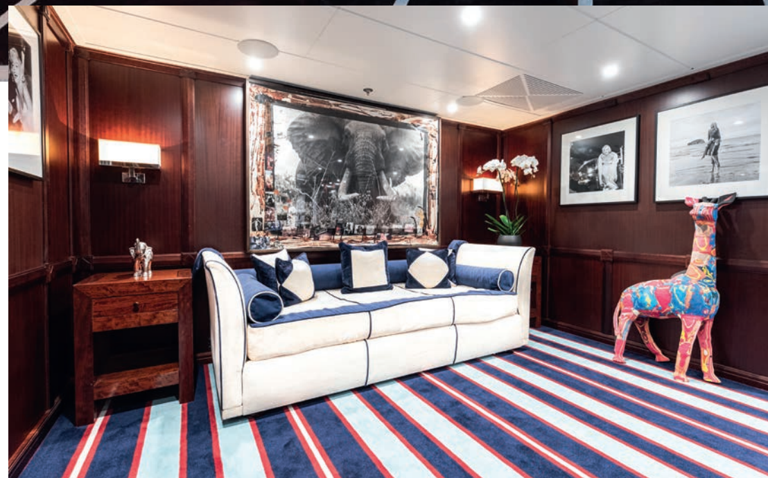
The design team converted the underused main deck lobby into a comfortable lounge. Left and opposite page, top: the VIP suite encompasses a bed to port and a lounge with convertible couch to starboard