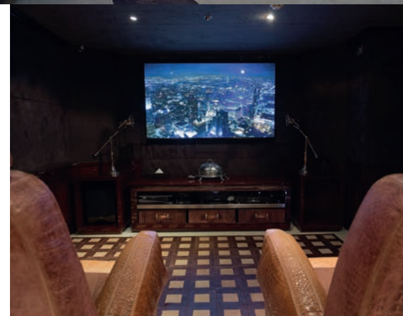
Above: the owner's deck salon. A dining table can be set up for private meals. A seven-seat movie theater (right and below) completes the owner's deck